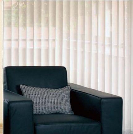
Fabric Verticals: A practical alternative to drapes and a great solution for sliding patio doors