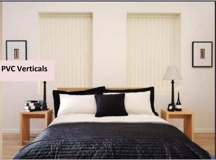
Smooth PVC Verticals

These Vertical Blinds are made of sturdy PVC, providing the durability and energy efficiency of vinyl and complete light control.